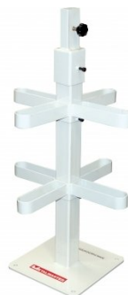
S2238 Steel Dolly Stand