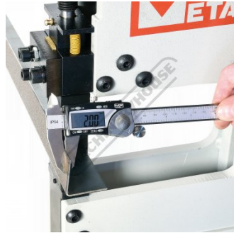
2mm Mild Steel Capacity