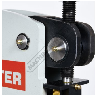
Head Pivot Points with Grease Nipples