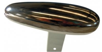
S2236 Oval Steel Dolly