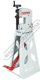
Right Angle View