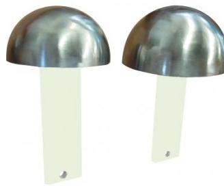
S2235 Mushroom Steel Dome Dolly Set - 2 Piece