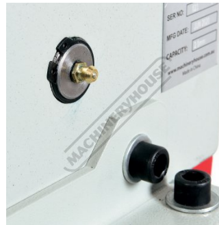
Foot Pedal Grease Nipple