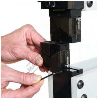
Dovetail Dies For Quick Self Aligning