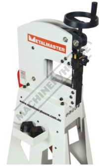
Head Top View