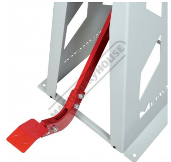
Foot Pedal Lever