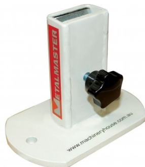
S2239 Dolly Stand Holder