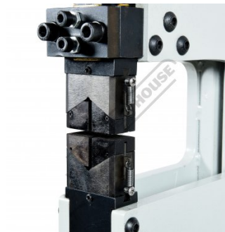
Shrinking Dies Shown On Machine