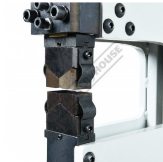
Stretching Dies Shown on Machine