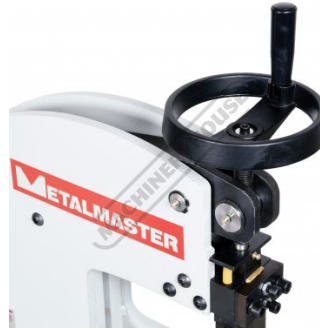
Material Thickness Adjustment Handle