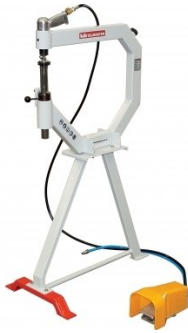
S227A Pneumatic Planishing Hammer