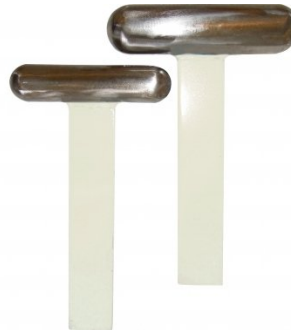
S2231 Straight Steel T-Dolly Set Large - 2 Piece