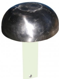
S2237 Bowl Steel Dome Dolly