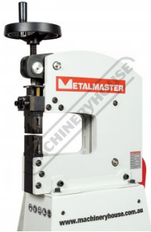
Head Side View