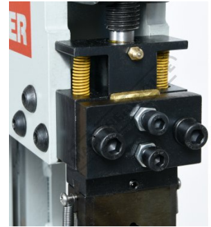
Top Die Holder