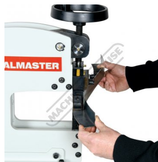
Stretching Dies In Action 2mm Mild Steel