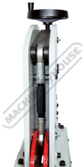
Turnbuckle Foot Pedal Position Adjustment