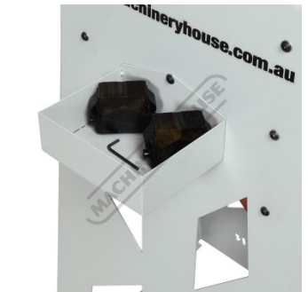
Die Holder Tool Tray