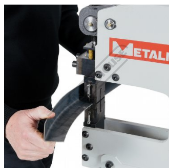
Stretching Dies In Action 2mm Mild Steel