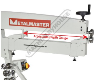
Adjustable Depth Gauge