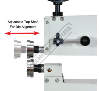
Adjustable Top Roller