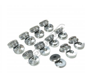
Included Die Sets