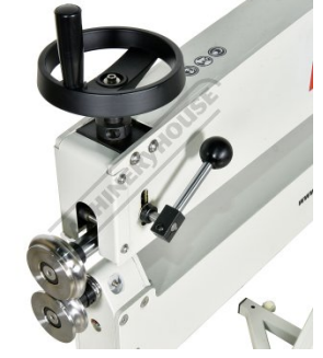
Upper Mandrel Adjustment Handle

Speed Control and On Off Safety Switch Die Rack Holder