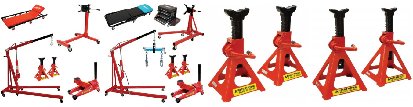
A3445 Professional Vehicle Axle Stands