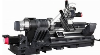
Puma 5100 Chassis