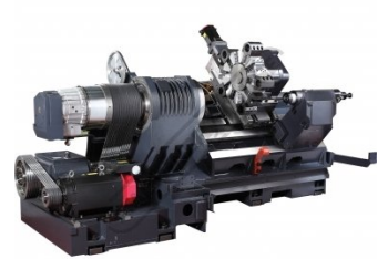
Puma 4100 Chassis