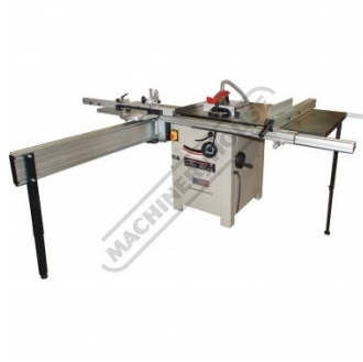
Material Clamp with Adjustable Guide Shown With Optional Table Saw