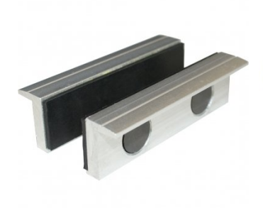
V050 Vice Brake Bender - Suits Bench Vices