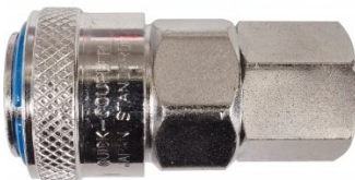
F945 High-Flow One Touch System Air Fittings