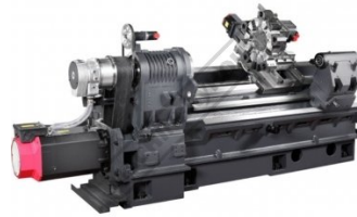
Puma GT Frame