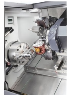
Puma GT Hobbing