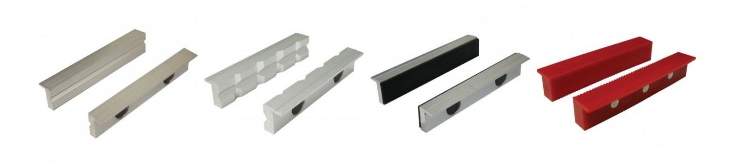
V0546 Plastic Magnetic Soft Jaws

Aluminium Magnetic Soft Jaws Aluminium Magnetic Soft Jaws Plastic Magnetic Soft Jaws Plastic Magnetic Soft Jaws