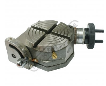
Rotary Table Shown Horizontally 0 Degrees