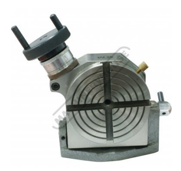
Front View Tilted 90 Degrees