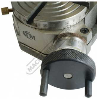
Graduated Rotary Table 360 Degree