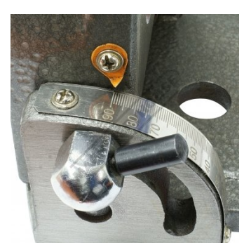
0 90 Degree Graduated Scale