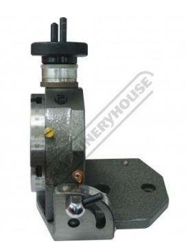
Side View Tilted 90 Degrees