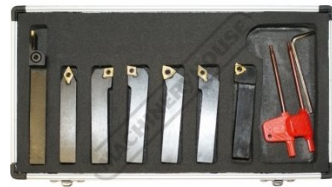
Top View In Box