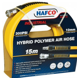
H008 Industrial Polymer Air Hose