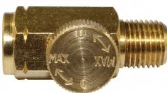
A219 Air Fittings