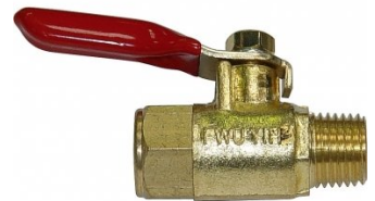
F930 Air Fittings