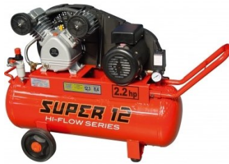
C511 Pilot Super Duty Air Compressor