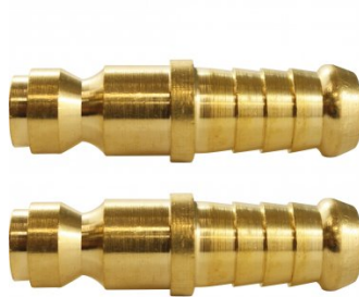
F906A Air Fittings