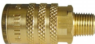
F901 Air Fittings