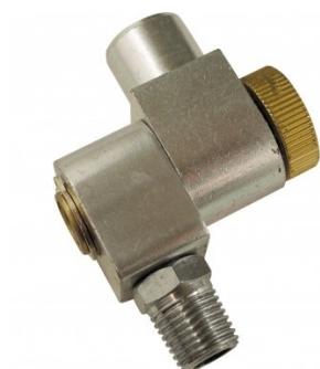
F800 Air Fittings