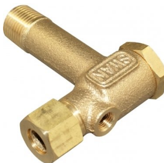
A230 Air Fittings