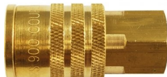
F900 Air Fittings