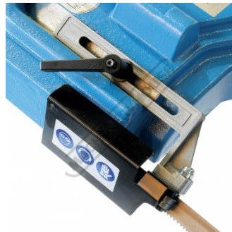
Blade Guide Adjustment