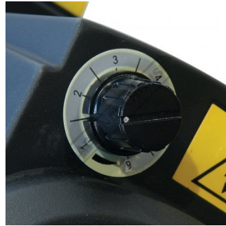
Variable Speed Dial