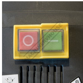
Main Power Switch