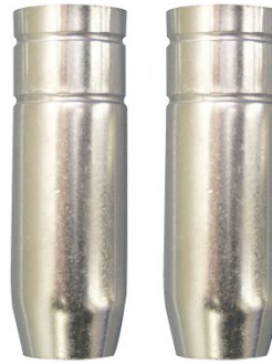
W535 2 x Conical Nozzles