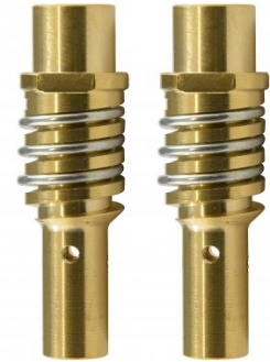
W537 2 x Contact Tip Holders