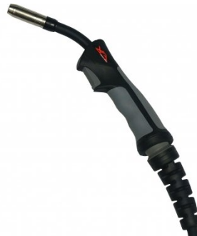
W542A MIG Torch - 3 Metre