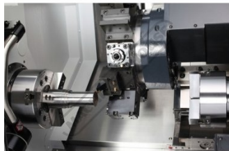
PUMA 2600SY Turning