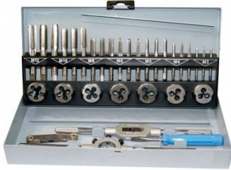
T013 Metric HSS Tap & Die Set - 32 Piece