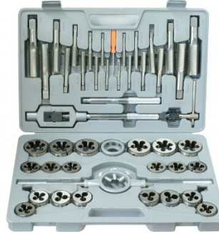
T015 Imperial Alloy Steel Tap & Die Set - 45 Piece