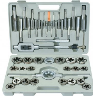
T014 Metric Alloy Steel Tap & Die Set - 45 Piece