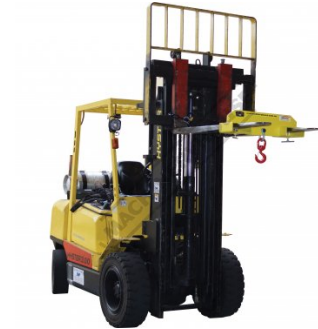
Shown mounted on forklift