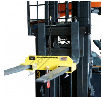
Shown with Forklift