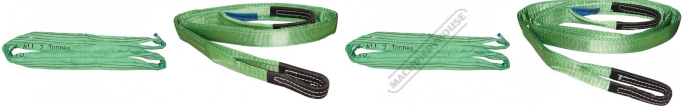
H324 Flat Sling