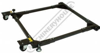
Square Maximum Size 750 x 750mm