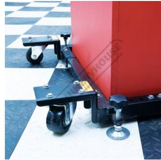
Swivel Castor 360 Degrees