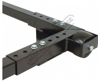
2 x Fixed Wheels