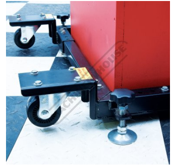
Hand Screw Positioning Lock