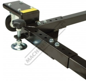
Adjustable Length Frame