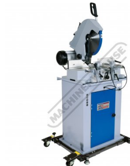
Shown With Machine