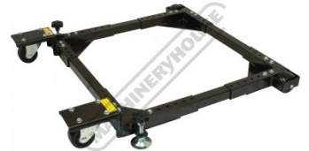
Square Minimum Size 580 x 580mm