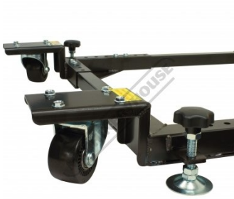
2 x Swivel Wheels with Adjustable Stops