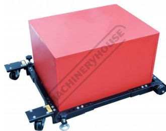
Shown with Box