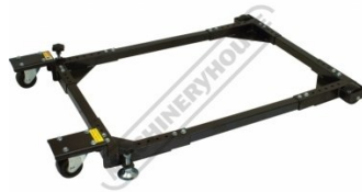
Rectangle 580 x 850mm Shown