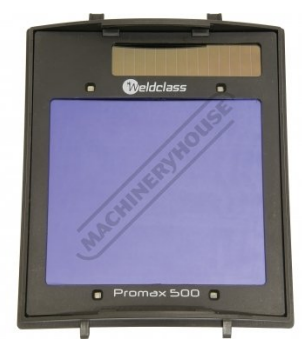
Front View Area