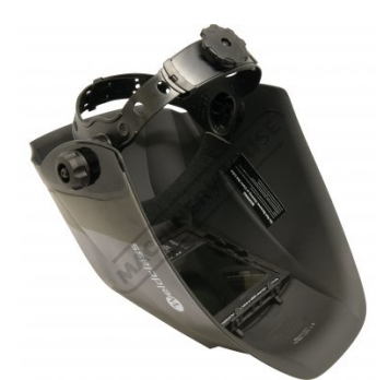
Rear Side View