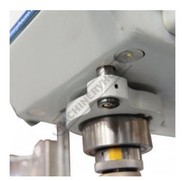
2 x LED Work Lights

sales@machineryhouse.com.au www.machineryhouse.com.au