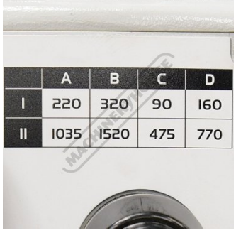
Spindle Speed Chart