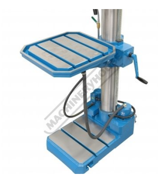
Rack & Pinion Wind Up Table