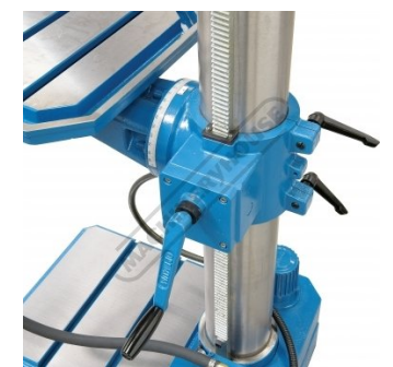
Table Tilts 90° Left & Right