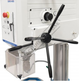
Quill Feed Handle