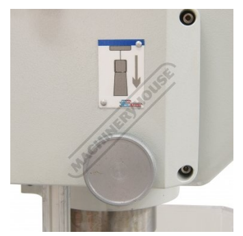
Morse Taper Drill Ejector