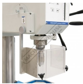
Adjustable Chuck Guard with Safety Micro 16mm Keyless Drill Chuck