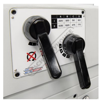
Spindle Speed Selection Levers