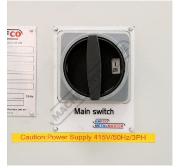
Main Isolation Switch