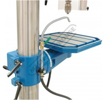
Adjustable Coolant Hose