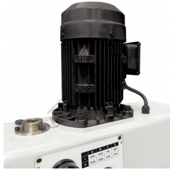
3hp 415V Motor