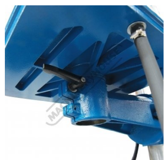
Table Rotates 360 Degrees