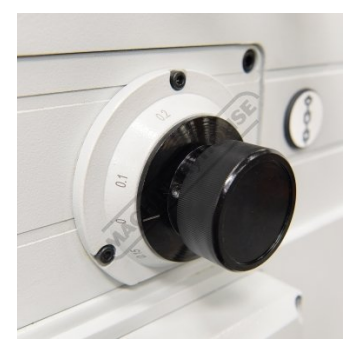
Automatic Feed Selection Dial