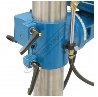
Table Positioning Locks