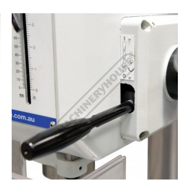
Feed Engagement Lever