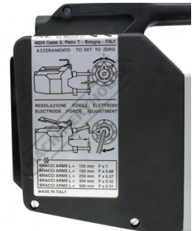
Force Adjustment Chart