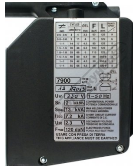
Specification Chart Weld Capacity