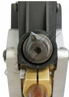
Clamp Force Adjustment