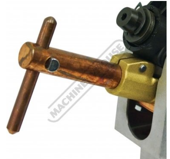
Top Electrode Holder