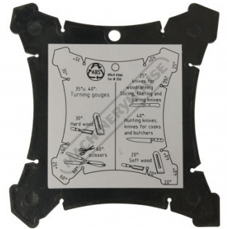
Angle Setting Jig