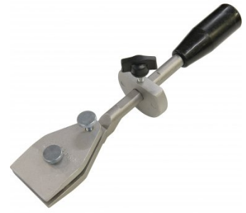
W8642 Jig 60 Knife & Blade Holder