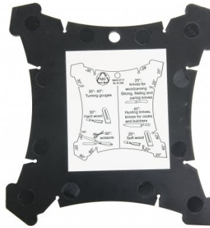
W8642 Jig 60 Knife & Blade Holder