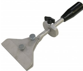
W8643 Jig 120 Knife & Blade Holder