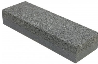
W8636 Stone Grader - Fine & Coarse