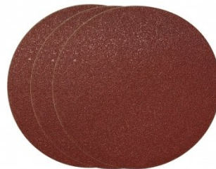
A5333 80G x 178mm (7") Aluminium Oxide Sanding Disc Pack