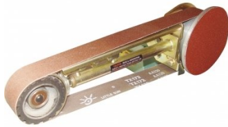
L088 Multitool Belt & Disc Linishing Attachment