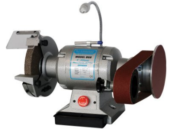
G156 Industrial Bench Grinder with Linisher