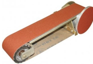
L090 Multitool Belt & Disc Linishing Attachment