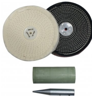
G185 Buffering Kit