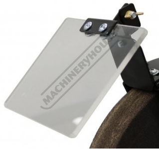
Adjustable Eye Shields