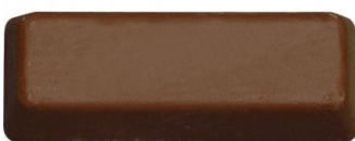
G320 Brown Buffering Compound