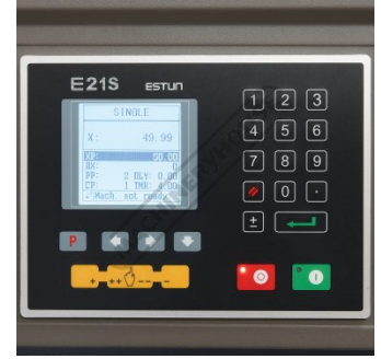
Estun E21S controller