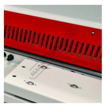
Ball transfer table