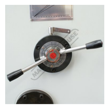
Rapid blade clearance adjustment