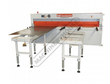
Optional ball transfer table extensions - Shown with different machine