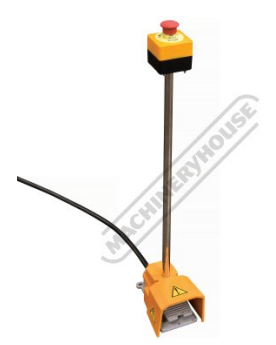
Mobile foot pedal