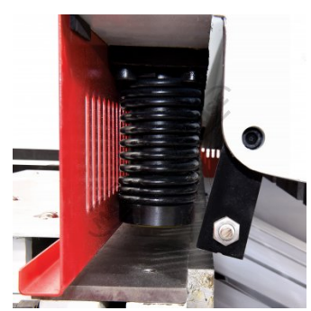
Hydraulic material hold downs