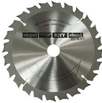
W879 Saw Blade - 160mm x 24T