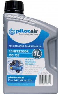
C347 ISO 100 Air Compressor Oil