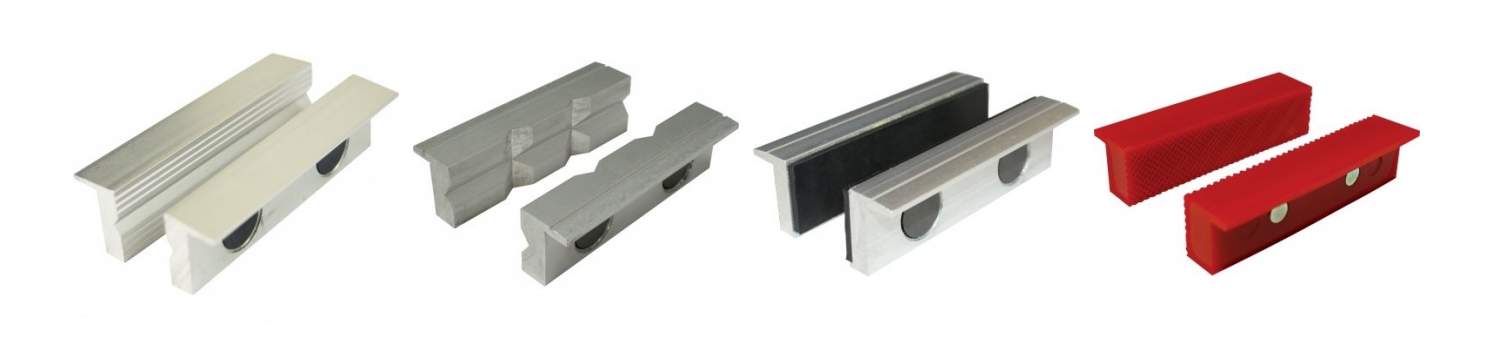
V0544 Plastic Magnetic Soft Jaws