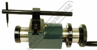
End Mill Grinding Attachment Side View