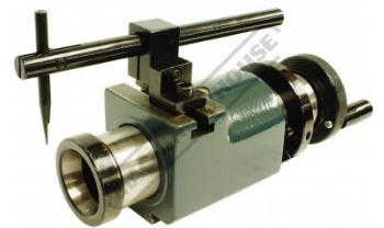
End Mill Grinding Attachment