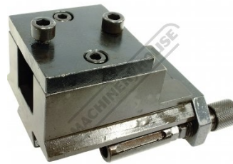
Lathe Tool Grinding Attachment