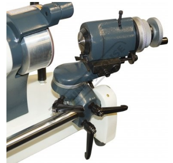
Front Close Up