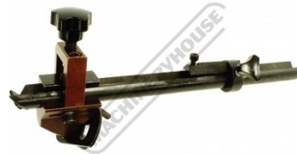
Drill Grinding Attachment