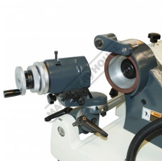
Close Up Rear View