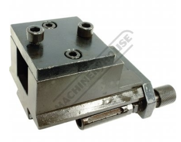
Lathe Tool Grinding Attachment