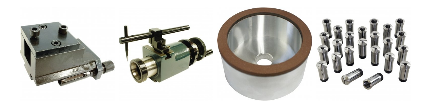
C985 5C Collet Set - 17 Piece

Lathe Tool Grinding Attachment End Mill Grinding Attachment Diamond Cup Wheel 5C Collet Set - 24 Piece