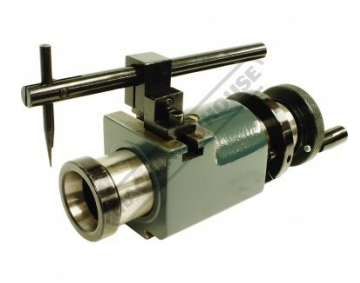
End Mill Grinding Attachment