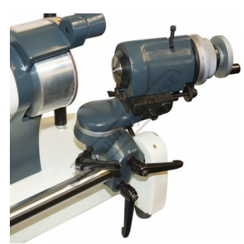
Front Close Up