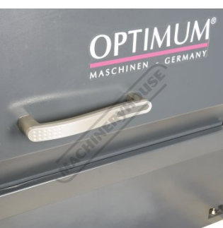
Heavy Duty Door Handle