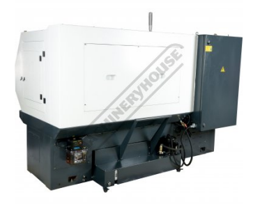
Rear Left View