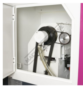
Headstock End View