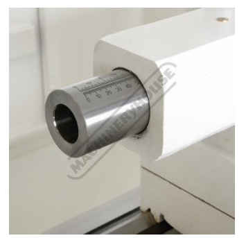
Tailstock Quill Graduations

sales@machineryhouse.com.au www.machineryhouse.com.au