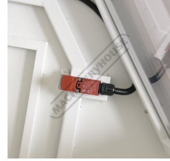
Micro Switch on Side Door