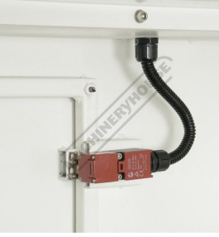
Micro Switch on Rear Door