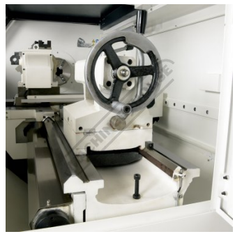
Tailstock End View