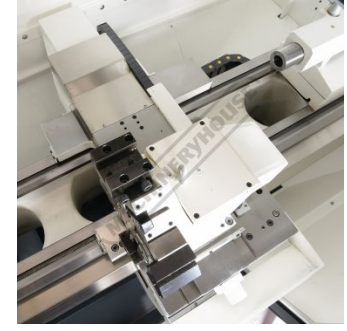
Top View of Tool Changer