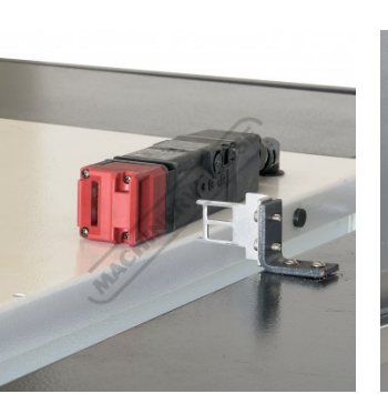
Micro Switch on Main Door