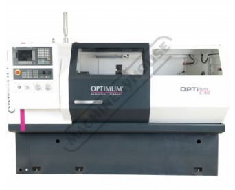
Front View Door Closed