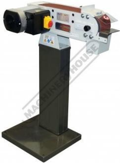
Shown With Top Lid Open