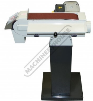
Side View With Lid Open