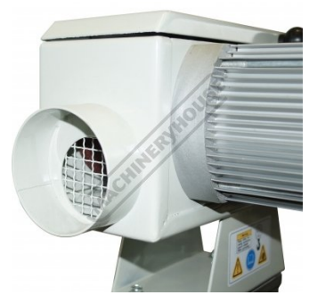
Rear Dust Chute